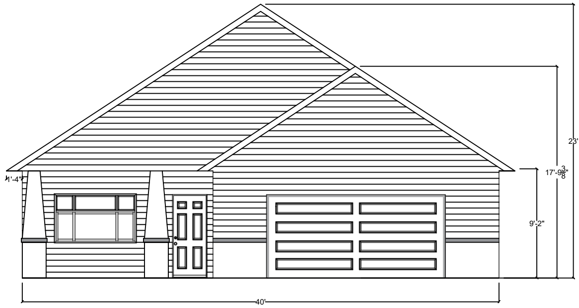
B 1 ELEVATION SCALE: 1/8" = 1'-0"