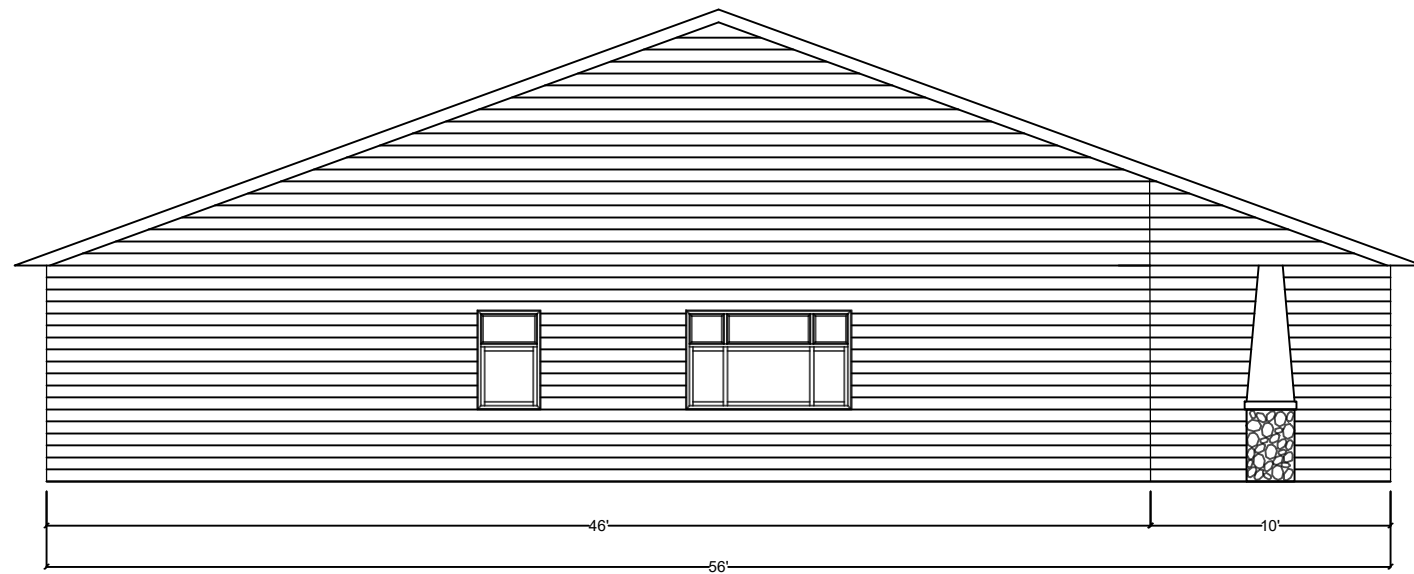
D 2 ELEVATION SCALE: 1/8" = 1'-0"